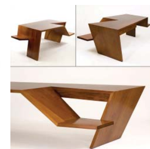
Image courtesy of Charles Rose Architects, www.charlesrosearchitects.com